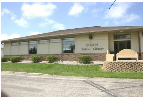
Gibbon Library - 1050 Adams Avenue (between Minnwest Bank and the City Park)